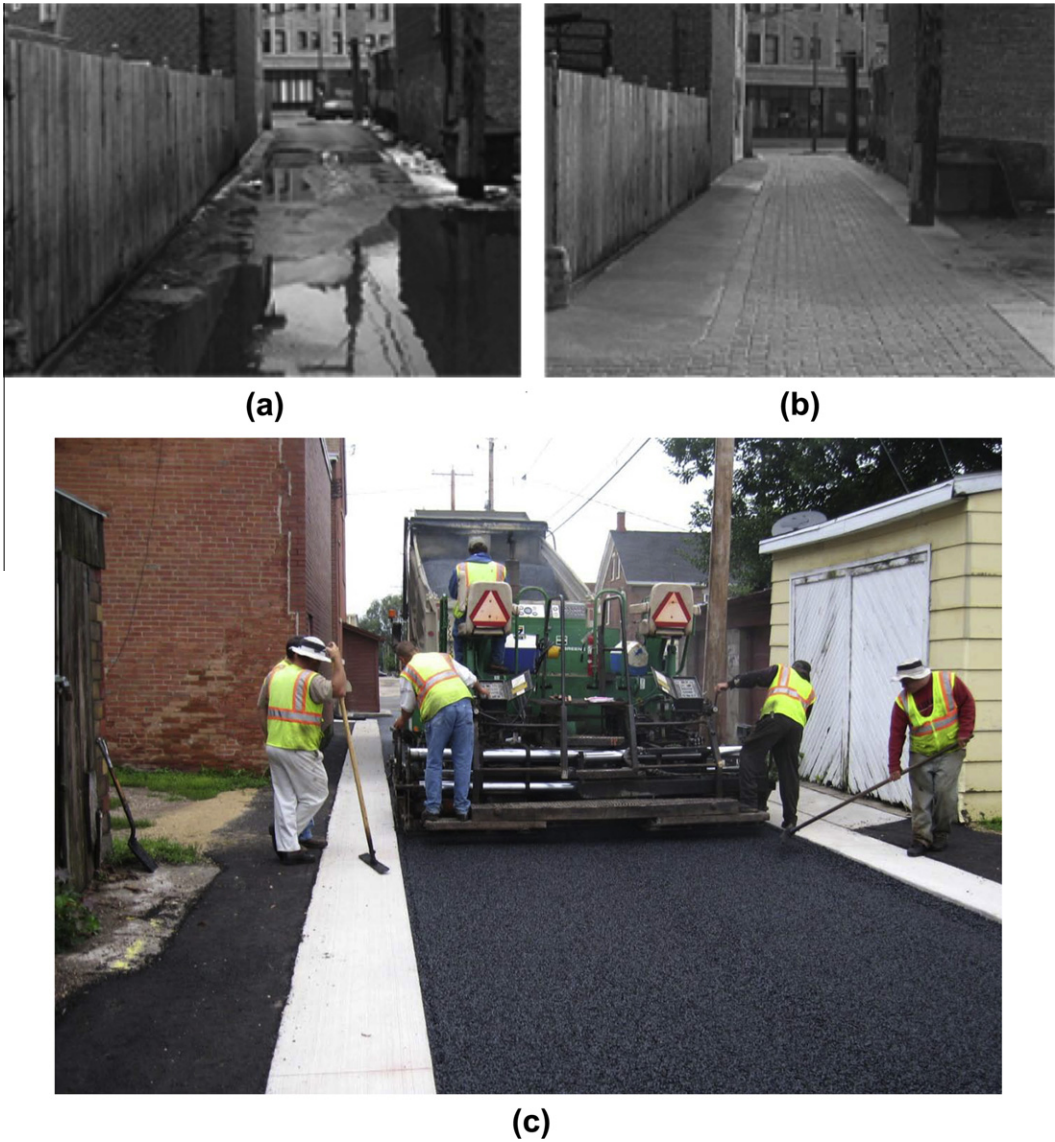
Fig. 1. Stormwater management retrofits in US alleyways. (a) A flooded, impermeably paved alley in Chicago. (b) The alley was resurfaced with permeable pavement. (c) Dubuque’s first green alley, being paved with permeable asphalt.