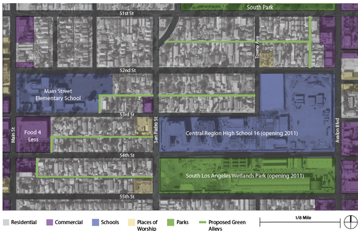
Fig. 5. Avalon Green Alley Network project area.

The explicit commitments to improving access to recreational and food resources in projects such as the Avalon Green Alley Network and the related South Los Angeles Green Alley Master Plan align with social equity values. The Master Plan seeks to increase access to green space “in one of the most underserved and economically challenged areas of the City of Los Angeles. Approximately 30% of [the city's] alleys are located in South Los Angeles, a blighted urban community with very little green space. Residents of South Los Angeles are disproportionately affected by poor air quality, have high rates of obesity, diabetes and heart disease, and have few or limited places to play outdoors” (City of Los Angeles Community Redevelopment Agency, 2010, p. 3). Similar text on providing recreational opportunities for residents living in a community with few safe green open spaces is found in Avalon Green Alley Network