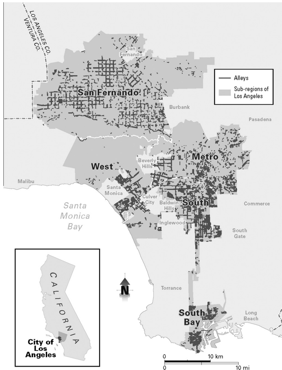
Fig. 2. Alley density in the city of Los Angeles, by subregion.

sist residents in garnering support for projects and in building a community of neighbors working toward (and later reaping the benefits of) a common goal. Some projects associated with the Los Angeles program similarly seek to build community and to empower residents to improve their neighborhoods, such as through the involvement of residents in the alley design process (this will be discussed in more detail in the following subsection).