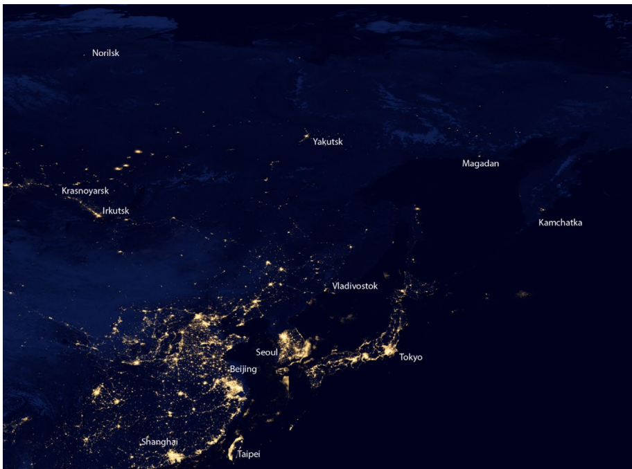
Figure 1. Nighttime view of Eurasia. In addition to cities, fires, fishing boats, gas flares, oil drilling, and mining operations can show up as points of light.

But scholars have largely been far less attentive to what may be Russia's greatest legacy to the planet: wilderness. Within the borders of the Russian Federation are some of the most extensive (largely roadless) wilderness areas remaining on Earth. This is vividly illustrated by a nighttime view of Eurasia, with the dark vast swaths of Siberia and the Russian Far East in stark contrast to the brightly lit cities and infrastructure of Eastern China, Japan, and the Republic of Korea (Figure 1). Lake Baikal alone holds one-fifth of the world's fresh water. Russia's forests comprise an astounding 20% of the world's remaining "frontier forest" (Potapov et al. 2008). Siberian tigers roam the Ussuri taiga forests along the Sikhote-Alin' Mountain Range, a region with the richest terrestrial biological diversity in Russia (Krever et al. 1994). While the forests of central Kamchatka Peninsula protect rivers containing some of the world's largest salmon runs, the oceans surrounding Russia are some of the most biologically productive waters on the planet (Newell 2004).